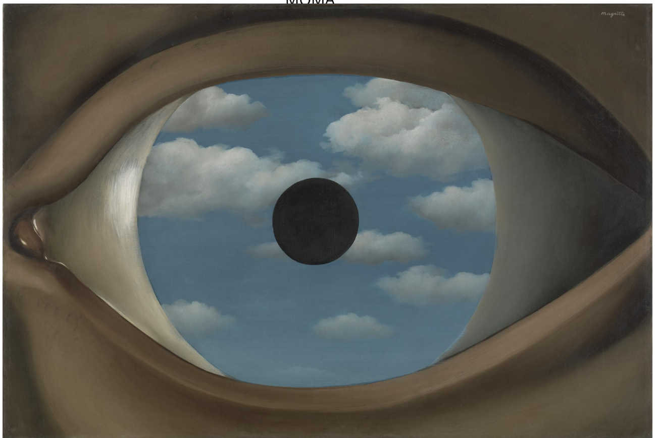
René Magritte (Belgium), The False Mirror , 1929

Fur-covered cup, saucer, and spoon. Cup Ø 11cm, saucer Ø 24 cm, spoon 20 cm long, MOMA