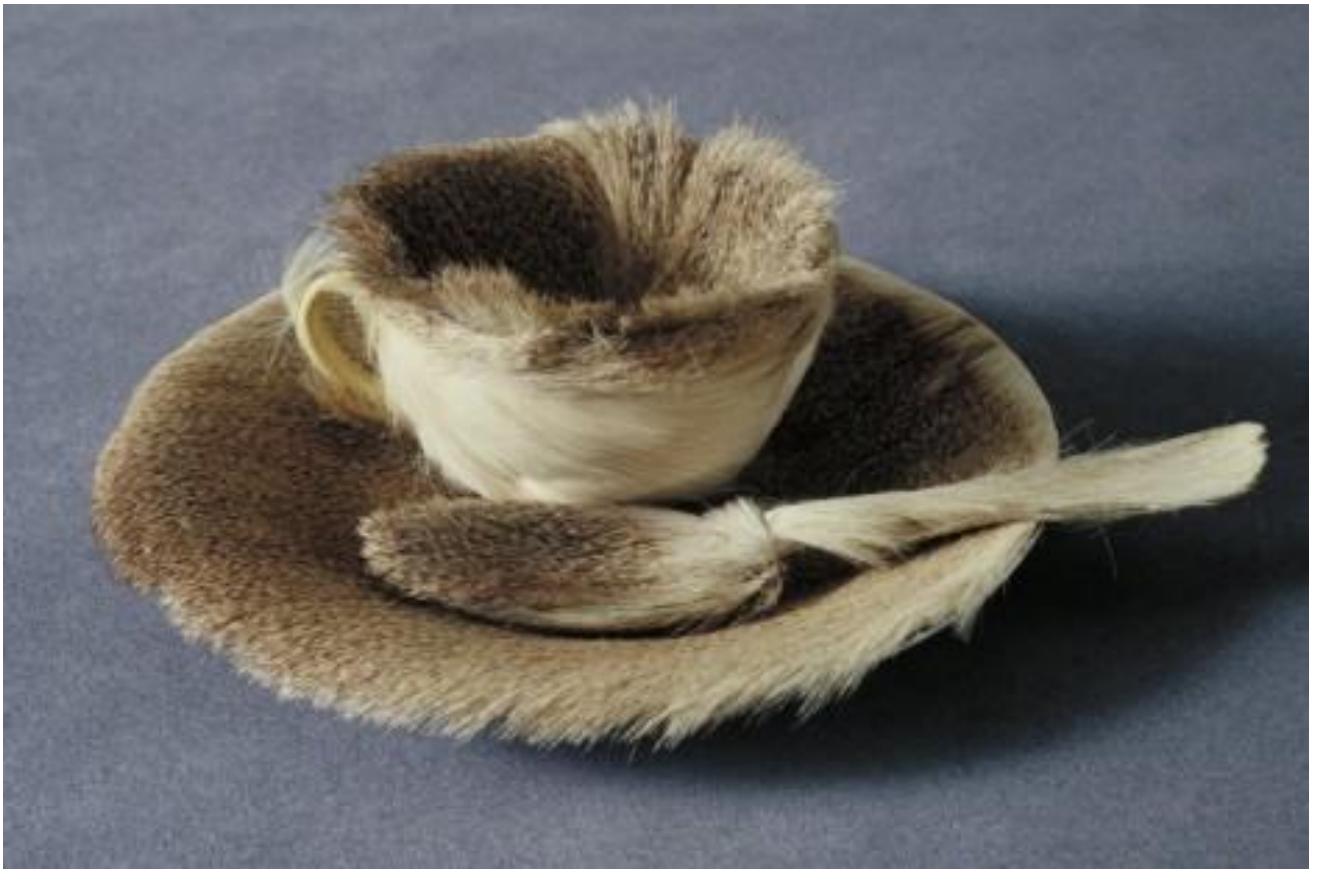
Meret Oppenheim (Switzerland), Object , 1936

Fur-covered cup, saucer, and spoon. Cup Ø 11cm, saucer Ø 24 cm, spoon 20 cm long, MOMA