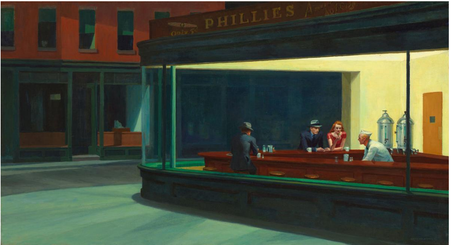
Edward Hopper, Nighthawks , 1942 Oil on canvas, 33 x 60", Art Institute of Chicago